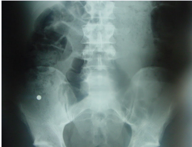
Fig. 2. Plain abdominal film showing migration of bullet to the right iliac fossa.