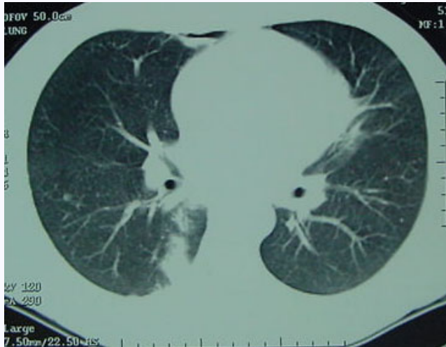
Fig. 3. CT chest with gunshot tract seen in right lung base.

Investigation of these patients includes chest X-ray, US scan, CT scan of the chest and abdomen and organ specific investigations. The plain chest X-ray shows the location of the bullet, heart size, pneumomediastinum, pneumothorax or haemothorax. The US scan helps detect cardiac tamponade as well as abdominal solid organ injury associated with travel of the projectile. In haemodynamically stable patients, the nature and order of investigations is a matter of debate. The most accepted order is aortic imaging followed by investigation for oesophageal or tracheobronchial tree injury (i.e. contrast study, endoscopy) [2] . Cornwell et al. [4] challenged this order of investigations in a retrospective study and suggested that delay in intervention for oesophageal injury, due to delay in investigation, is the principal cause of septic complications. Contrast enhanced helical CT scanning is a safe, efficient and cost-effective diagnostic tool. Further organ specific evaluation can be performed on