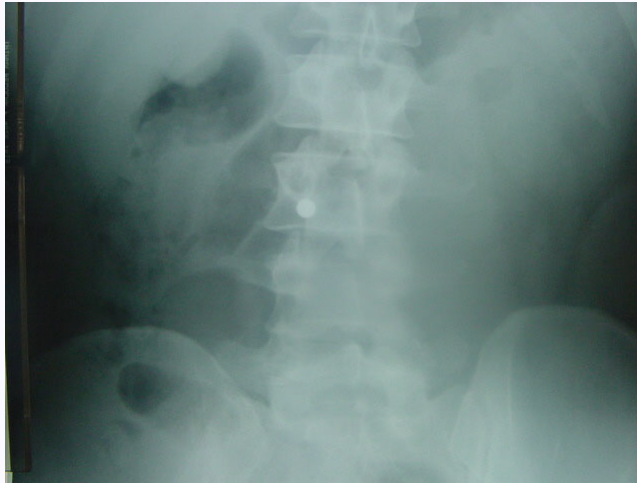
Fig. 1. Plain abdominal X-ray demonstrating bullet at L3 level.

lumen of the caecum (Fig. 4). All the intra-abdominal organs were normal. During this period of observation he remained stable but reported one episode of minor haemoptysis. He was transferred to a level 1 trauma centre with a possible diagnosis of perforation of the oesophagus. A water soluble contrast study of the oesophagus and stomach was performed. There was free flow of contrast into the small bowel and no evidence of an oesophageal leak. The CT scan was reviewed and the results of the earlier study were confirmed. He remained well clinically and tolerated an oral intake well. Four days later a bullet was recovered from his stool, confirming its presence within the gastrointestinal tract, and was preserved for forensic examination. He was discharged the following day. He has remained well since.