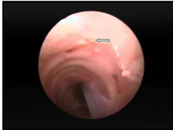
Fig. 2. Upper trachea. The arrow points to the coagulated vascular lesion.

bronchoscope, under general anaesthesia, the bleeding point was clearly seen, thanks to the very clear magnified images available.